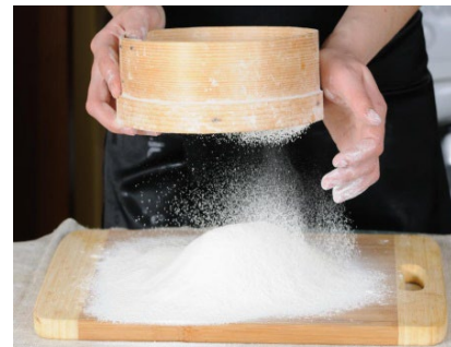
Figure 1: The traditional process of sifting flour

It is done by holding the sieve with one hand and tapping the strainer.