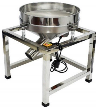
Figure 2: Electric flour sifter

Due to the effect of vibration, the flour particles will move on the sieve. (Separation Solution: Choose an Electric Flour Sifter, n.d.) These sifters use electricity, so they consume more energy, which leads to increased energy costs for the user. Electric flour sifters are more costly to purchase and maintain for small-scale industries. Also, flour is waste as it remains on the sieve.