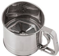
Figure 3: Squeeze flour sifter

Squeeze the sifter and squeeze the handle to release the flour through the mesh screen.