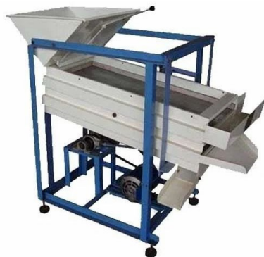
Figure 4: Semi-automated flour sifter

A semi-automated machine can operate using single-phase current. Has a 3 HP (horsepower) motor. Has 150 kg/hr. of flour sieving capacity. However, the cost of this machine is around ₹36,000 (14151.42 Rs.), which is a high cost. (Flour Sifter Machine, n.d.) Skilled workers are also required to operate the product. Other than that, it also requires a lot of space to install the product.