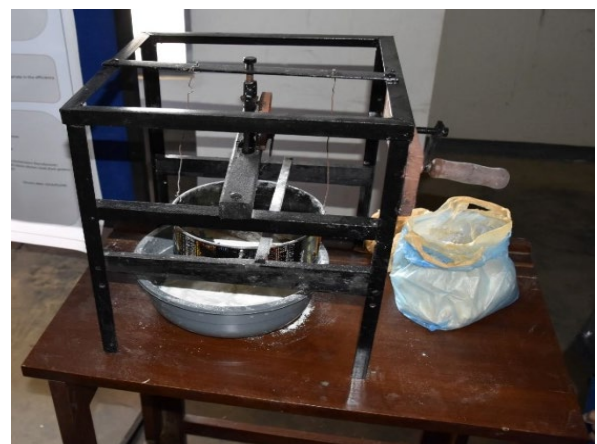
Figure 7: Final design of the flour sieve